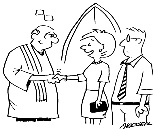
"The heart-shaped communion wafers were a nice touch for Valentine's Day."

The teachers are only needed for two weeks out of the month. The kids that are without teachers are the preschool and the 2nd/3rd grade class. The preschoolers are so eager because it's all so new. The 2nd & 3rd graders are a good group of kids interested in the way things were and how this relates to today. We hope you will consider giving them some of your time.